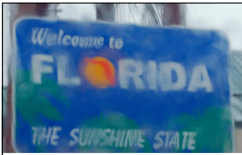
Florida greets us with liquid sunshine

Just Thinking -- From the 1930's into the 1970's there was a newspaper cartoon by Al Capp called Li'l (Little) Abner. It was also made into a movie a couple of times. Anyhow, one of the minor characters was a little man that was followed by a rain cloud, wherever he went. Bad luck would follow Joe Btfsplk (that's how it was spelled; don't ask how it was pronounced.).