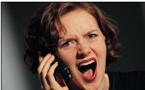
**Note -- File photo; not Miz Savon or Miz Kaye

Just Thinking -- We were at our son’s wedding recently and all of the arrangements had been made for the reception to follow the ceremony. The menu had been planned and agreed upon and the food was to be set up by the end of the wedding.