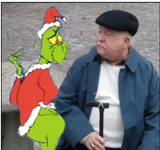
The Grinch character was created by Theodor Seuss Geisel (Dr. Seuss); drawn by Chuck Jones.